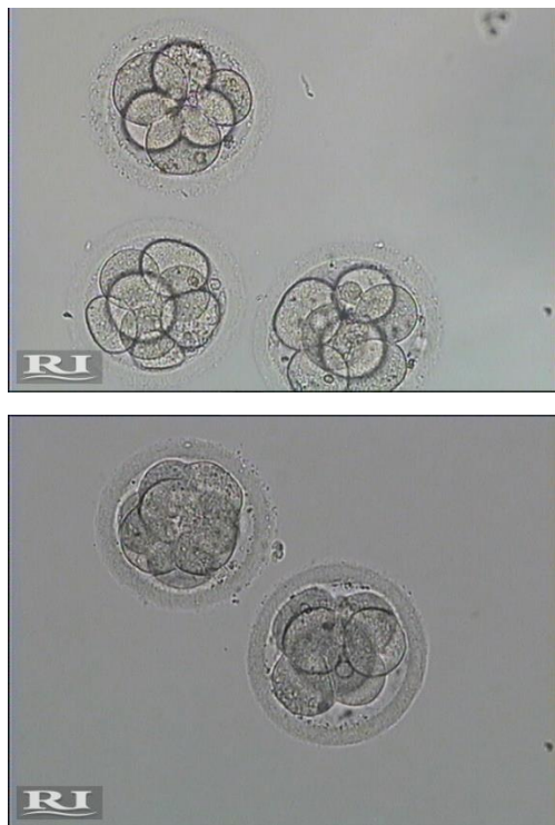
Fig. 2: 8-Cells Embryos