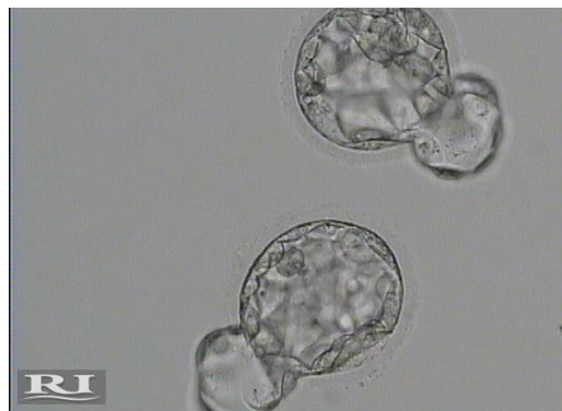
Fig. 4: Hatched Blastocyst Embryos