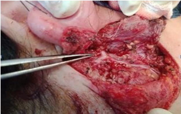
Fig. 1: Exploration of facial nerve

the facial nerve. A dissector is used to travel along the facial Surgical Technique of Extracapsular parotidectomy. In a preauricular crease a modified Blair incision was made that ran down into the subcutaneous tissues and platysma muscle. Elevate the anterior flap to the front of the gland just beneath the larger auricular nerve and the parotid fascia. palpate Above it was a tumour and a cruciate incision. locate and