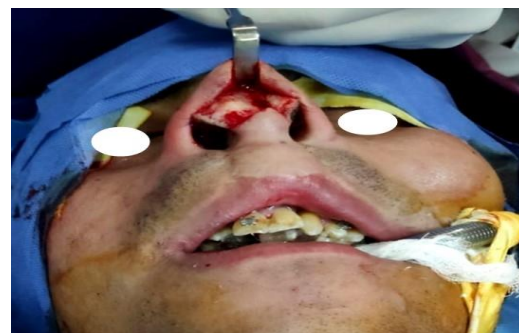
Fig. 3: shows the incisions in the infra-lobule area that were continued till fused with the rim incisions to complete the open approach.