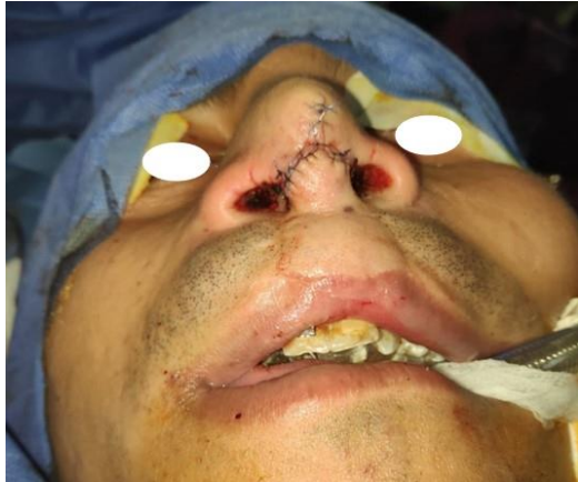
Figure 5: shows that the incised V was closed in Y manner to address the final shape of the nose after tip definition and columellar lengthening.

Sliding, suturing, and reshaping of the medial crura of lower lateral cartilage in both sides achieved to give a cartilaginous columellar length. Inter-domal suture was carried on as usual. Then the fibrofatty flap is turned over towards the columellar base, giving a bulge that enhances the infra tip lobule and gives the sloping shape of infra tip area as well as it modulates up the depressed tip. Then closure of the