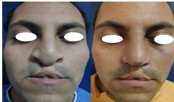
Fig. 6: 26 years old male patient presented by post bilateral cleft nasal deformity. Pre and 12 months post-operative submission to the proposed technique. Front views.

In accordance with this study's results, functionally all patients have completed the nasal obstructive symptoms evaluation scale and the linear symptom evaluation scale pre- and post-operative showed improvement of the respiration (Table 3). Objective aesthetic assessments of Facial angles and nasal facial landmarks (Figure 1A, B) showed marked improvement of the columellar height in relation to the nasal height in all cases. The dropped nasal tip has been improved in all cases with near normal projection. Confidence interval showed that more than 98% improvement in both functional and aesthetic outcomes. Most patients were most satisfied with their postoperative results when measured by the visual analogue scale (VAS), with the dorsum, uneven alar bases, and the nostril coming in close behind. Each of the patients was happy with the results of the procedure, and several even said they would have it done again in the future if required.