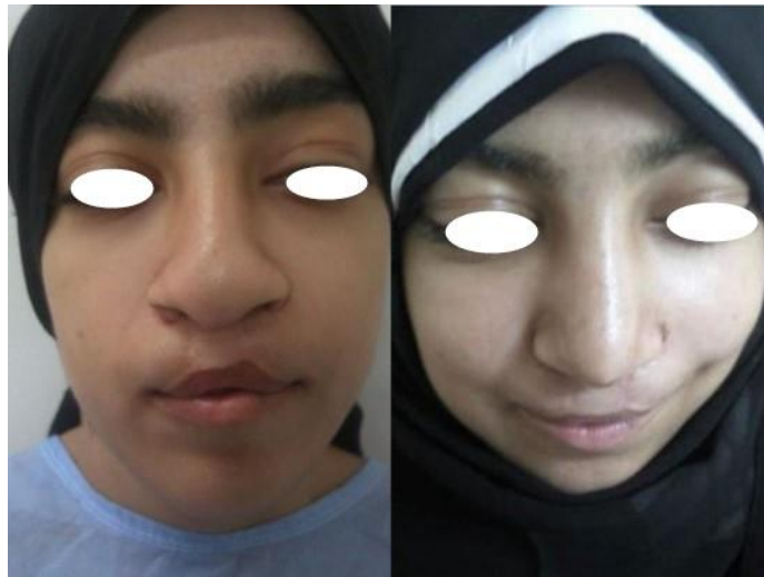
Fig. 8: 18 years old female patient presented by post bilateral cleft nasal deformity. Pre and 6 months post-operative submission to the proposed technique. Frontal views.