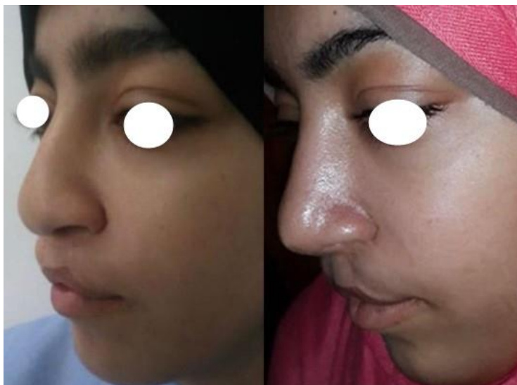
Fig. 9: 18 years old female patient presented by post bilateral cleft nasal deformity. Pre and 6 months post-operative submission to the proposed technique. Lateral views.