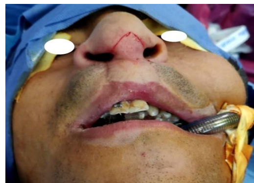
Fig. 2: shows an inverted V- columellar incision started in infra lobular area.

Incision: Open rhinoplasty with inverted V-columellar incision started in infra lobular area to steel skin from the tip towards the deficient Columella (Figure 2). The incisions in the infra-lobule area are continued till fuse with rim incisions to complete open approach (Figure 3). Then subcutaneous dissection of the skin of the tip is continued laterality and cephalic till complete exposure of the tip. Gentle dissection and caution are practiced preserving fibrofatty tissue. Fibrofatty tissue is randomly elevated, and the flap remains attached and based caudally to preserve blood supply (Figure 4).