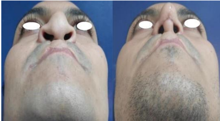
Fig. 7: 26 years old male patient presented by post bilateral cleft nasal deformity. Pre and 12 months post-operative submission to the proposed technique. Basal views.