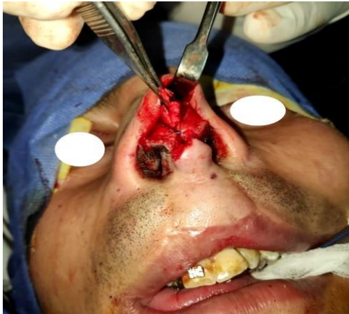
Figure 4: shows a fibrofatty tissue was elevated and the flap remained attached randomly and based caudally to preserve blood supply. Also, it shows the medial crura suture that were carried on as usual. Then the fibrofatty flap was ready to be turned on towards the columellar base.