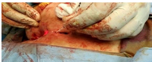
Fig. 4b: Laser pilonidoplasty (destruction of sinus wall ) .