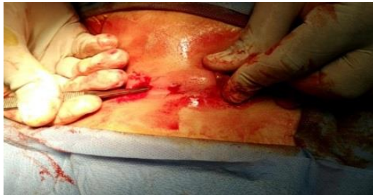
Fig. 3: curettage of sinus tract to remove unhealthy granulation tissues.