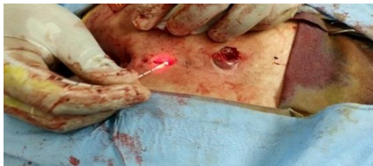
Fig.4 a: Laser Pilonidoplasty(destruction of sinus opening)