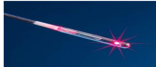
Fig.1 : Fiberoptic probe

The heat energy delivered from diode laser through fiberoptic probe acts on vaporization of water content of blood (resulting from curettage of the sinus tract after cleaning) leads to photocoagulation and ablation of sinus tract leads to steaky sensation during exit of the probe from the tract with the obliteration of sinus tract is palpated. ,Fiberoptic probe :Flexible, radially emitting laser fiber that emits laser beams in 360o as in fig. 1 .