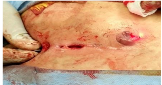
Fig 4 c: Laser pilonidoplasty ( destruction of sinus tract ).