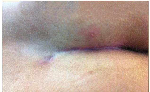
Fig.5: Three months Post operative Pilonidoplasty.